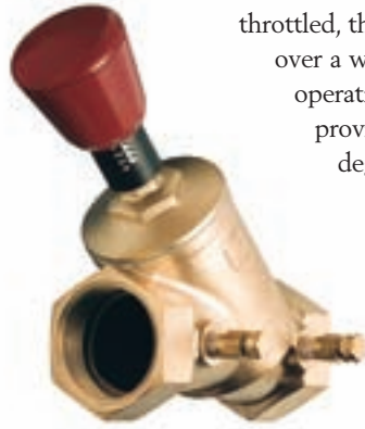
Variable Orifice: Up to +/- 15% when throttled.

Another aspect of flow regulation that affects the performance of the valve is the adjustment precision and repeatability. This is where more sophisticated valves also shine. A 90-degree ball or butterfly valve – which shouldn't be used in the lower 60% of the throttling range – really only has 36 degrees of adjustment precision. Additionally, these valves usually incorporate a simple graduated scale that makes it virtually impossible to accurately read the valve handle position, or to return the valve to a precise throttle set-point.