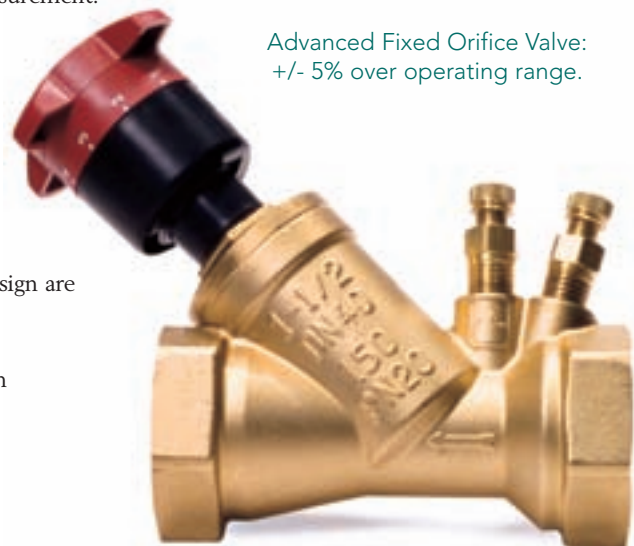
Advanced Fixed Orifice Valve: +/- 5% over operating range.

2. Measuring the pressure drop across a valve seat for flow correlation, often referred to as variable orifice flow measurement, is unacceptable where higher accuracy is required. This technology can provide required accuracy only when the valve is wide open, diminishing to +/- 15% deviation or more, as the valve is throttled. Surprisingly, many valves of this design are still used in North America, even though the valve isn't capable of meeting most balancing specifications, as soon as the valve is throttled even a fraction of a turn. Instead, these valves should be used in conjunction with an alternate technology fixed orifice flow measuring device, such as a venturi or orifice plate.